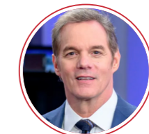
Bill Hemmer Fox News anchor and former MUDEC student

These individuals exemplify the university's ability to shape leaders and global influencers across politics, business, sports, and culture.