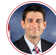
Paul Ryan Former Speaker of the U.S. House of Representatives 2012 Republican Vice-Presidential candidate