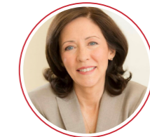
Maria Cantwell U.S. Senator, State of Washington