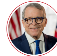
Mike DeWine Governor of the State of Ohio, Former Congressman