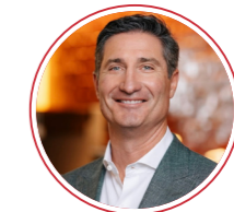
Brian Niccol CEO of Starbucks